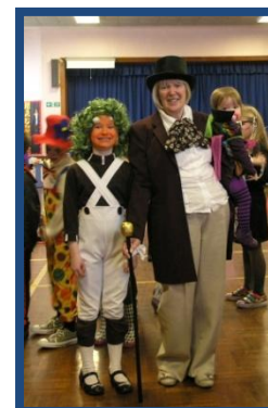
Halloween Activity Afternoon